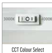
CCT Colour Select